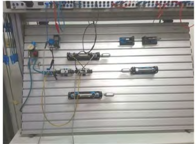
Fig. 2. The Fixed electropneumatic trainer (Festo didactic).

The proposed teaching aid is designed as a sorting machine based on weight and using PLC as main controller. The design performance refers to learning outcome needs and adopt the problems solving activities in PLC and Pneumatic course. Figure 3 shows the proposed teaching aid design.