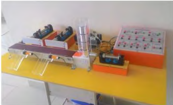
Fig. 4. The overall final product of teaching aid for PLC-electropneumatic based automatic sorting machine system.

After following all stages of research in the form of aferomentioned development research, the final product of teaching aid used in lectures. The overall of final product is presented on figure 4. For pneumatic cylider and its solenoid valve directly adopt the part of fixed Festo didactic component. Trapping bar is made from light alluminium sheet and the other casing made from acrylic. All terminals in panel is connected by banana plug within 24 Vdc operational voltage.