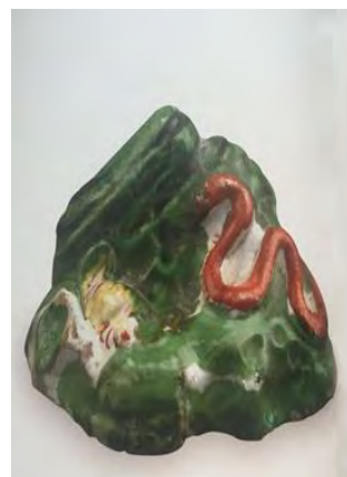
Fig. 3. The red and green porcelain of sneak and scorpion fighting against each other.

Secondly, in terms of artistic style, the Jin Dynasty red and green porcelain also drew nutrients from sculptures such as stone carvings, clay sculptures and wood carvings. In 1972, Jin Dynasty Red and Green Buddhist statues were unearthed in the Fengfeng mining area of Handan, Hebei. Among them, the statues of Sakyamuni, Manjusri and Samantabhadra were particularly eye-catching, relevant scholars called them “The Three Sages of Huayan”. The concept of “The Three Sages of Huayan” is a theory formed in the Tang Dynasty. The sacred four ancestors of Huayan made it clear in “Three Sages Enter the Door of the Temple” that “The Three sages are the Sakyamuni, Manjusri and Samantabhadra”. 2 Due to the spread of Huayan Thought, a large number of works with the theme of “The Three Sages of Huayan” appeared in the art of stone sculpture, stone carving and bronze carving in Tang, Song and Liao Dynasty. Jin Dynasty inherited the legacy of the previous generation, still focus on the theory of harmony with Huayan. Typical representatives of the Jin Dynasty Huayan statue include the Manjusr Hall of Fo Guang Temple on Wutai Mountain in Shanxi Province, the statue of the Tibetan Buddhist Hall in Huayan Temple of Datong.