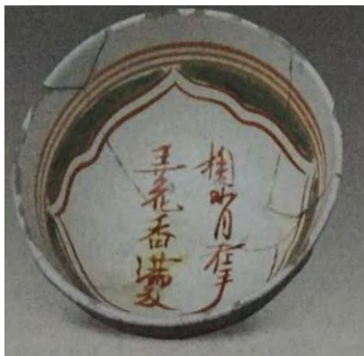
Fig. 17. "Ju Shui Yue" bowl.

In addition to the above-mentioned typical examples, there are also philosophical poems such as "Jiu Zhong Ceng De Dao" (monk realizes the truth from the wine), "Yue Ri Wu Bing Shan" (the moon is like a non-handle fan), "Feng Yao Qing Mai Lang" (rippling green wheat in the wind), "Xing Hua Han Wei Fa" (apricot Apricot flower is not blooming due to cold day), and so on, here we do not explain one by one. The emergence of these poems fully demonstrates the prosperity of the development of literature and art at that time and its penetration into the people.