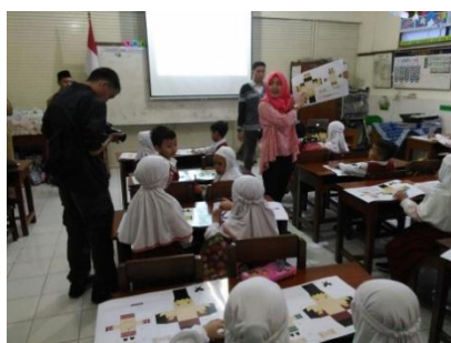
Figure 4. The author tells about Pandawa characters in detail through paper toys as the learning media.

In this stage, students listen to and observe any description given by class teacher and author through paper toys. The story about the character of Pandawa characteristics contains positive educating moral message; thus, it is unsurprising that the students are provoked to follow or to imitate Pandawa behavior concerning positive values such as kindness, prudence, honesty, loyalty to religion tenet, bravery, tenacity, decorum, gentleness, trusteeship, and reciprocity. A two-way interaction is made in this stage as well, by involving students, in which when class teacher and author tell story, the students are asked for their opinion on the character of individual Pandawa figures. Students sometimes are asked whether or not they have characteristics like Pandawa. Through storytelling using paper toys media and active interaction with students, they seem to enjoy and to pay attention to class teacher and author's explanation about Pandawa figures' behavior that can be imitated by students.