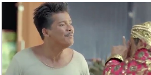
Fig. 2. The Djarum 76 Javanese Genie

The narcissistic version of Djarum 76 video advertisement told us about a man's effort from the lower economic strata who wanted to be famous. In the video, he was wearing a worn-out gray shirt which looked so dreary. The man was pictured as a not-really-handsome person with a dark-brown and less sharp-nosed. His mustache, lips, and eyes were not very appealing, and his hair was messy. By directly looking at his appearance, it was obvious that he would not be able to be famous without working hard. He wanted to spread his photographs all over Indonesia in a quick and instant way. In the video, the man said to the genie, "I want to be famous in Indonesia, I want my photos to be everywhere". As the genie understood the wish, he immediately granted the wish according to his own interpretation. From the genie's perspective, becoming a public service model for smoking advertisement was a way to be famous because the man's photograph would be displayed on every cigarette packaging.