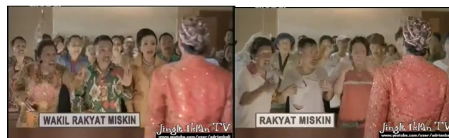
Fig. 3. The transformation of people's representatives

The next video is the job promotion version. It tells about a vice chairman who wanted to be promoted quickly as the chairman. The genie granted the wish by omitting the "vice" term on his nameplate on the desk. This thing was protested by two groups of other meeting participants. The first group was the representatives of the poor, and the second group was the representatives of the small people (inferior). They believed that the promotion from vice to chairman would increase the incomes. It could be seen from the seat he occupied which initially looks simple and then turned magnificent after he was being the chairman. Because of that, the representative of the poor people group wanted the promotion as well. The genie eliminated the word 'representative' on their signboards so that they became the poor people. Their appearance also changed, which was originally styled in luxury with suits and good dresses, then turned into the poor people dressed in rags and shambles. Then the genie offered the same thing to the representative of the small people group. In an instant, they refused and begged to the genie not to turn them into small people.