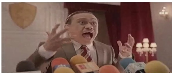
Fig. 4. The candidate of the leader

The Campaign version of Djarum 76 video ads started with a couple of well-dressed husband and wife in a quiet room that was separated from the crowded one. As the man held a magic pot, he opened it and the genie went out from the magic carafe. Then, the man wished to be a firm, trustworthy, and honest leader. Of course, the genie granted what has been asked. Then, the man entered the crowded room with the banner "vote me" behind the podium where the man was standing and said, "I want to get wealthy, have plenty of houses, and dozens of luxurious cars, and also have affairs everywhere", with a confident gesture and a loud voice. Realizing his words was not right, he closed his mouth while the woman beside him being surprised and angry because of the man statement.