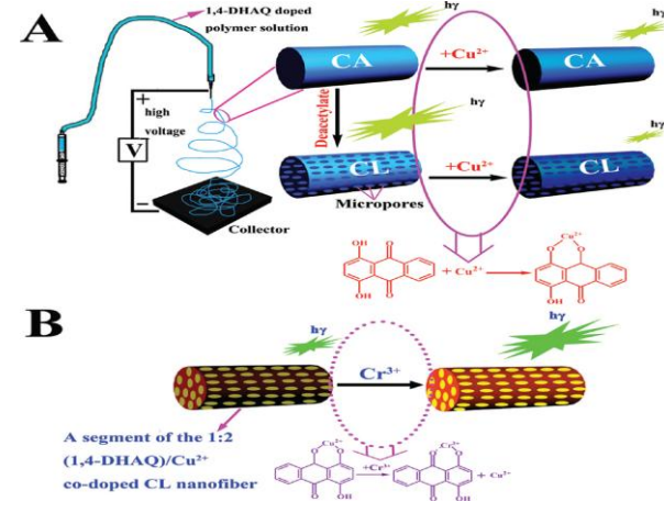
Figure 3. The specific experimental process and principle

Futhermore, Min et also obtained a metal ion sensor based on fluorescence and electrospun membrane. As a Cu^{2+} sensor, the electrospun membrane could reach a low limit detection of 1.1 \times 10^{-9} M and had a good selectivity .In addition, a kind of Cu^{2+} sensor with excellent repeatability had been obtained by Sun [9]. The PS electrospun membrane was deposited on the electrode, then a layer of gold film was sputtered onto the surface of electrospun membrane by a kind of vacuum sputtering technology. Finally, MPA (mercaptopropionic acid) was immobilized on the electrode by self ssembly technology. The test indicated that the limit detection could reach 5 ppm. What's more, the sensors could be repeatedly used for ten times.