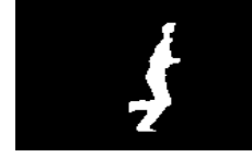
(c) Binary foreground image