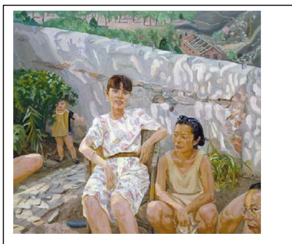
FIG.3, oil painting , " Life in an instant "