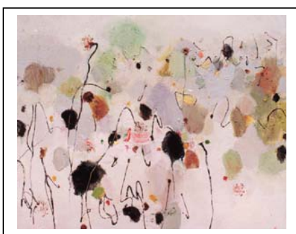
FIG. 2, oil painting , " the scenery of Lotus pond "