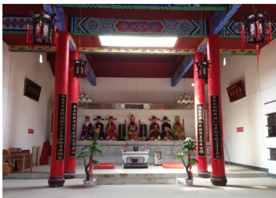
Fig. 4. Couplets and Inscribed Tablet of the Duan's Ancestral Hall