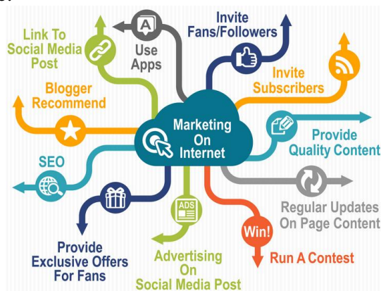
Figure 1. The General Flowchart of the Modern Internet based Marketing

The Internet has the unconsciously penetrated into our lives, and as we can on the cable offline business O2O mode also got great development. As the BAT in the O2O layout, O2O also once again become the focus of industry development. We see not only the Internet, mobile Internet enterprises in developing O2O business, the traditional industry such as catering, tourism, retail, housekeeping, wedding, maternal and infant industries are O2O business layout, digging a new customer. O2O, so to speak that has become involved in many industries a new nuggets point. O2O is the purpose of the user from line to line down consumption, in the development of China's Internet industry and the O2O business started very early development. Before conducting in-depth analysis on the O2O, we firstly demonstrate the general flowchart of the modern Internet based marketing in figure one.