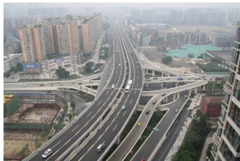
Figure 1: the city of Chengdu 2nd Ring Road Viaduct (taken on May 28, 2013)

In the two ring road viaduct bridge opened to traffic, the speed limit of 80 km / h, the bridge under the speed limit of 60 km / hour speed limit on ramp along the 40 - 50 km / h, in accordance with the provisions of the existing ring elevated road, pedestrians and nonmotorized traffic day ban. On - and off ramp is set 3 metres overhead, trucks and large and medium-sized passenger car all day ban on bridge. The two loop two upper middle lane is 18 metres long capacity bus rapid transit (BRT) 24 hour lanes, all without traffic lights, all located in the bus station 28, take the K1\K2 bus rapid transit through the ring only 40 minutes a week, at speeds of up to 40 km / h or more, while the original sit 51, 52 road two ring ring bus usually takes 90 minutes to 120 minutes, at a speed of only 15-20 km / h. The two ring road bridge on the two-way 6 Lane (2 lane for fast bus lanes), the road red line width of 42.5 meters of standard section.