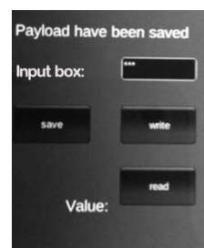
Fig3.a The initial interface Fig3.b Clicking save button