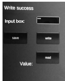
Fig3.c Writing success