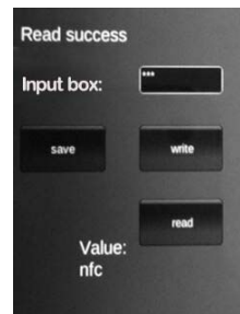
Fig3.d Reading success