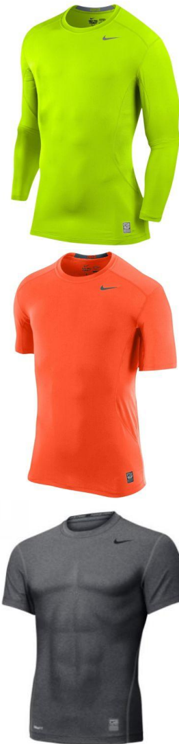
Fig 1. The Sample Cool Core Fabric based Clothing