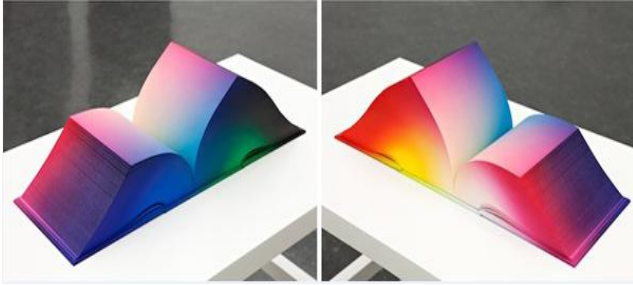
Figure 2. The Example of the Color Feature based Design Pattern