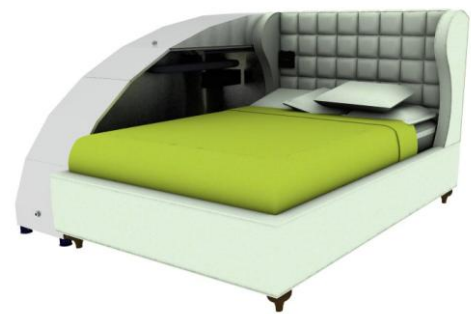
Fig1. Bedside table beside bed

Except the design of beside table itself, the matched design also should be taken into concern. Such as the storage space which can store the supplies for the usual life as well as the disaster. Meanwhile, some clothes or cotton fiber could be stored inside to warm people after the earthquake. The earthquake alarm is installed on the headboard which can wake up the sleepy people to self-rescue in emergency circumstances. The bedside table is connected to the bed, and there could be more bedside tables available to protect more family members.