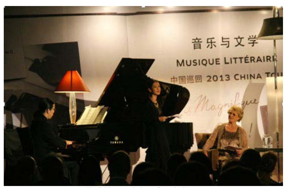
Fig.2 The revelation of music literature

In the process of music literature, it has many forms. Such as traditional drama and opera, modern musicals and score prose, etc. The common development of music and literature in a variety of forms are making progress and merging constantly. The fusion feature is reflected by the characteristics of music literature in society. Music literature is recreational, educational, artistic, and it shows the cultural function of literature, the revelation of music literature as shown in figure 2.