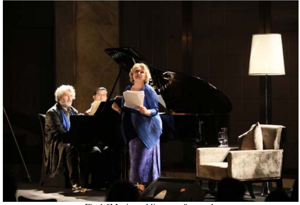
Fig.1 "Music and literature" tour photo

To explore the value and function of music literature, we want to observe shanzhai culture on different cultural perspectives. There are a lot of information feedbacks on the literature view. It reflects the different audience's psychological acceptance. The creativity of art space becomes stronger and stronger. Literature and music are not adapted to the individual form. The music under the literature view is paid more addition to the development of literature. The audience is not only master the meaning of literature, but also pursue the uniqueness of literature and expand the social function of literature. Based one the development of culture, It formed a specific cultural phenomenon. As shown in figure 1, Sofitel luxury hotels "music and literature" tour activities at sofitel wanda Beijing on May 8. The purpose of living is in the form of piano playing and reading interpretation of classical music and literature, for the audience to a French feelings with Chinese elements.