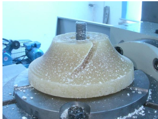
Figure 3. Application in itegral impeller machining

The proposed 5-axis NURBS interpolation method has been realized in the developing 5-axis CNC system. The type of the 5-axis machine is table tilting/rotating. Fig.4 shows that the CNC system is controlling cutting tool along a NURBS curve path to machine an impeller.