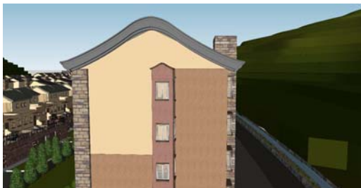
Picture 3. Roof of new WangNao village