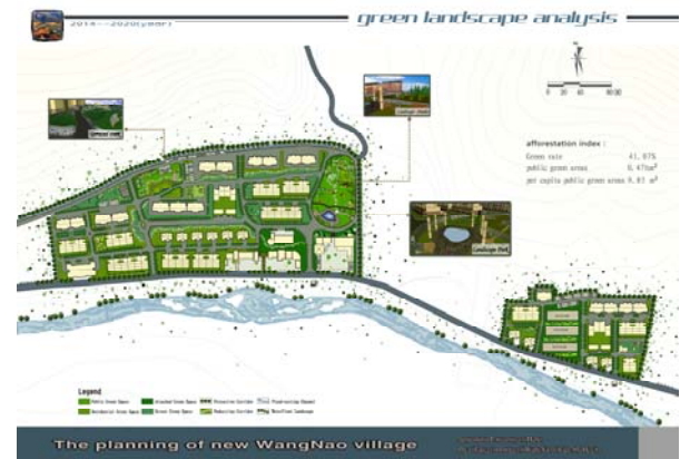
Picture 4 The green landscape analysis