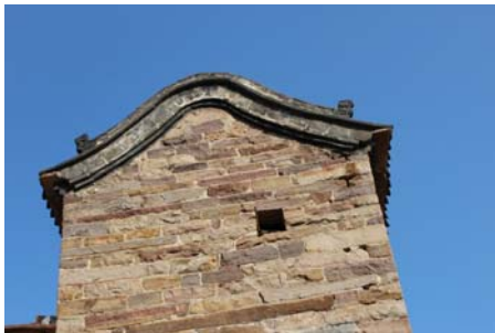
Picture 2. Roof of old WangNao village