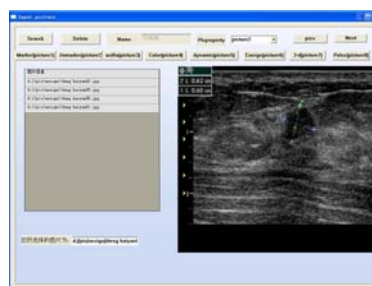
Fig.2. Module of the images and Retrieval

Images in the database including the sonograms, mammography and pathology images. We collected these images from the continuous following up of the patient. Thereinto, the sonogram includes 2D BUS images, 3D BUS images, PWI and CWI. And the marked and unmarked 2D BUS images were put into the database separately. They were organized in the following module (shown fig.2.)