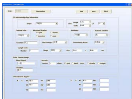
Fig.4. The module for Ultrasound Information

Five doctors who have more than 10 years of BUS examination were invited to collect the information of the image. Based on the static images and active films of the mass, the doctors described the mass according to the Breast Imaging Reporting and Data System for Ultrasound (BI-RADS-US) [9]. The description included 2-D ultrasound image (boundary, margin, size, orientation, texture, calcification, capsule, position, surrounding tissues, lymph nodes et al), CDFI (vascularity, the number, position and trend of the vessels) and PWI (velocity and resistance index of the arteries and veins). The information was stored into the database by the module for Ultrasound information. (Shown in Fig 4.)