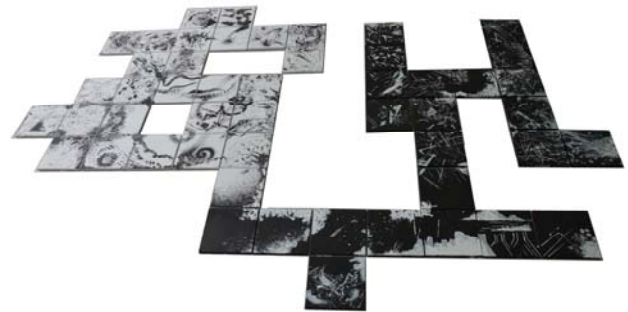
Figure 2. Aesthetical results.

solicited both in terms of virtual and physical boundaries. More than that, the playful and pitoric spirit of the game makes it so that even the weakest personalities can easily deal with the concept of borders and improve their capacity in mediating social actions without getting scared. Therefore, it has to be noticed that, URP for the very same reasons kind of stimulate the self-consciousness of both aggressive and remissive personalities. This makes of it a good candidate has method to be used in art-therapy.