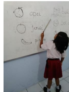
Figure 1: The learning atmosphere in ES.

The implementation of education in Extraordinary School (ES) are to: (1) provide the widest possible opportunity for all students who have physical, emotional, mental, and social disabilities or have the potential for intelligence and/or special talents to obtain quality education in accordance with their needs and abilities; (2) realizing the implementation of education that respects diversity, and is not discriminatory for all students, (Riwanto, 2018). Figure 1 below shows the learning atmosphere in ES. Students seemed enthusiastic about learning mathematics, but without using teaching aids.