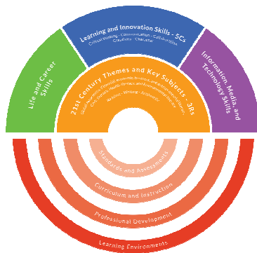
Fig. 2. Framework Of 21st Century Learning [9]

In general, the 21st Century Skills Framework shows that education in the 21st century is dominated by core competencies such as reading, writing and arithmetic obtained while attending education will be the basis of other competencies. Trilling and Fadel [9] clarify the 3R core subject function in the context of 21 century skills, 3R is translated into [1] life and career skills, [2] learning and innovation skills and [3] information media and technology skills.