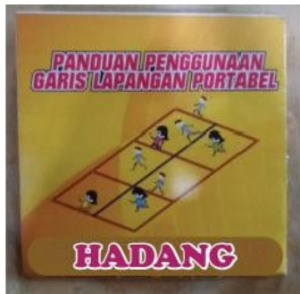
Fig. 8. Guidance for Using the LFH Product