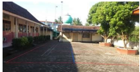
Fig. 5. Portable Line Field Hadang in Conblock Field