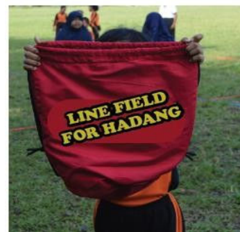
Fig. 6. LFS bag