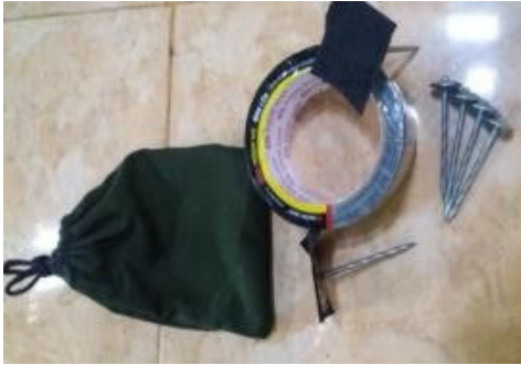
Fig. 7. Nails and duct tape