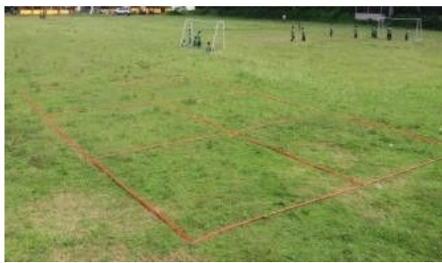
Fig. 2. Stage One Product Revision Results

Based on suggestions from material experts as explained in the previous discussion, products in the form of learning tools that are being developed can be revised based on these suggestions. The first phase of the revision was to evaluate the design of material experts and physical education infrastructure. After evaluating the design of the material expert and infrastructure expert, then proceed with the manufacture of the LFH in accordance with the advice and evaluation given by the material expert and physical education facility infrastructure expert.