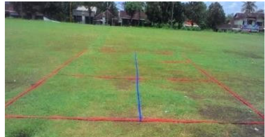
Fig. 4. Final Product Results

The final product of the LFH was further refined by making its completeness in the form of usage guidelines and tape sticks used to install the LFH in the conblock or cement field which previously in revision II could only be installed in the grass field. Besides being equipped with usage guides and also duct tape for installation in the field of the block, the LFH also has a bag for easy storage and easy to carry everywhere. The final product line field of Hadang can be seen in the following image: