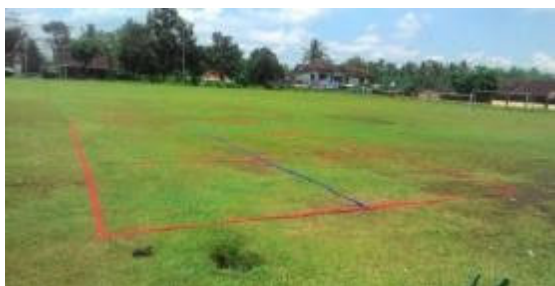
Fig. 3. Phase Two Product Revision Results

The second phase of the revision was carried out by refinement of the LFH along with its completeness, in accordance with the evaluation in Phase 1 of the LPGS product, which was accompanied by completeness in the form of stakes made from iron for grass or soil. Then the difference with the product before being revised in the second stage is the color of the hadang line which was originally red in color changed to blue, in addition to making the field lines more attractive also to show that the LFH.