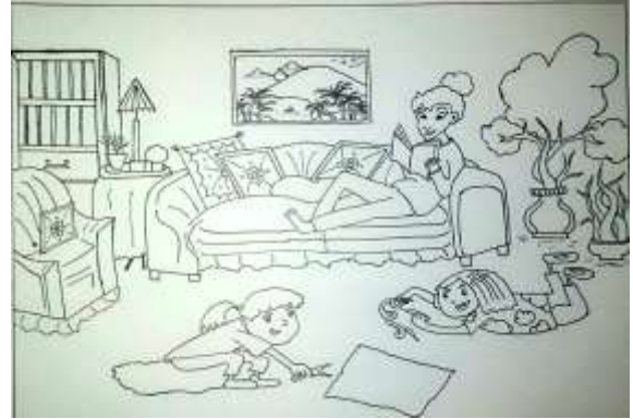
Fig. 2. Example of the coloring book

book as shown in Fig. 2 and 3. These figures suggest the parenting-themed coloring book has a moral message.