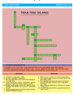
Figure. 1. Magazine development: (a) cover, (b) table of content, (c) page 3, and (d) page 13