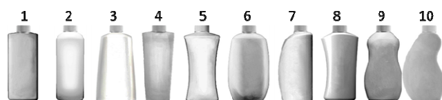
Figure 3 The 10 sample shape

To establish realistic human emotional responses to the bottle images, all the samples were taken from existing cleaning products on the market. The forty-five samples were then categorized by industrial design students into five shape groups using the KJ Method - "square bottles", "round bottles", "flattened round bottles", "convex and concave bottles", and "oblique bottles". "Flattened round bottles" were then branched into two categories - "circular, flat bottles that expanded at the bottom" and "circular, flat bottles that contract at the bottom"; "convex and concave bottles" were branched into four categories - "concave bottles", "convex bottles", "one-sided concave bottles", and "one-sided convex bottles"; "oblique bottles" were branched into two categories - "symmetrical bottles" and "asymmetrical bottles". After the grouping, ten samples were then selected from each category to best represent their visual shape as Figure 3.