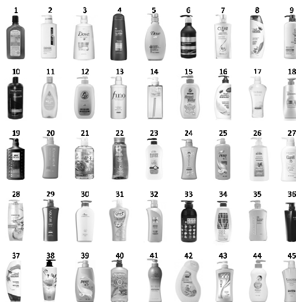
Figure 2 The 45 image bottles

The selected samples are cleaning products on the Taiwanese market with capacity ranging from 450(ml) to 750(ml). To avoid colour disruption on the image and to allow test groups to focus on the bottle figure, all the sample images used in the experiment were de-saturated. The forty-five sample image bottles can be seen as Figure 2.