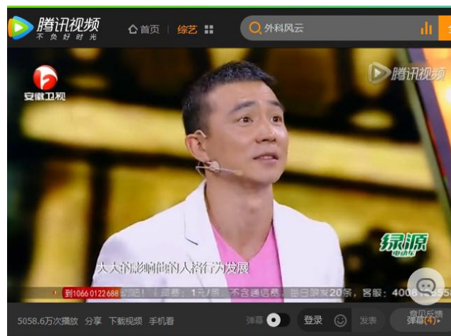
Fig. 5. Anhui Satellite TV, Super Speaker , June 6, 2015, 3rd Season, 12 Issue.

In Super Speaker , the words of Actor Liu Genghong made a warm atmosphere among audience in his speech My Dear Children . His memory, his devotion and his love to kids moved audience deeply. "Fig. 5"