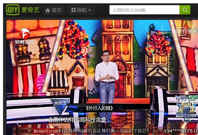
Fig. 3. Anhui Satellite TV, Super Speakers , the Finals of the 3rd Season, June 13, 2015