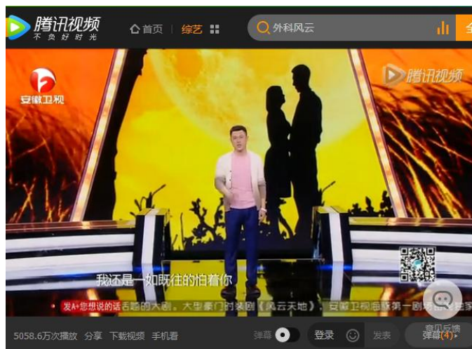
Fig. 4. Anhui Satellite TV, June 6, 2015, Super Speaker , 3rd Season, 12 Issue.

tenderness. Using "When You Grow Old" as background music, audience is so enjoyed in his speech. "Fig. 4"