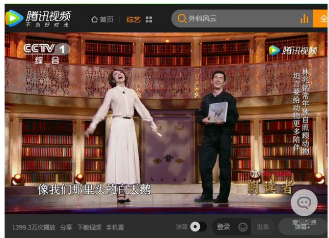
Fig. 6. CCTV1, February 25, 2017, Readers , 2nd Issue.

In the program of Readers , the show up of Dong Qing gives audience a kind of intellectual beauty and aesthetic temperament. This undoubtedly comes from her simple and elegant clothing, aura makeup and graceful pace. In her later program, in order to alleviate a wild animal keeper's nervousness, he asked: "Look at me! What animal I look like?" The animal keeper answered: "white swan, elegant and noble". Of course, it is not only the contribution of the static situation language. But its importance cannot be ignored. "Fig. 6"