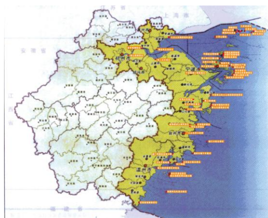
Fig. 2. Distribution map of typical oceanic tourism resources in Zhejiang

The oceanic tourism resources in Zhejiang account for 20% of total. If develop the coastal homestay houses to improve economic benefit with the advantageous coastal conditions and strong ocean culture background in Zhejiang, the development space is very big.