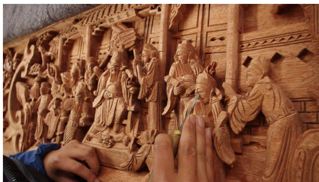
Fig.5. Handcraftsman is making figures for opera carving in traditional ways.

Opera carvings made on ancient stage are mainly on wood. Some others are brick carvings. Opera carvings are always colored by authentic gold foil on some exquisite stages and typed colored. Typed colored is the way to express opera story and figures' different features. Different colors are used for increasing festival atmosphere. Typed colored technique balances the dull color of the stage and it is always used for external opera carving decorations. Gold foil decoration is used as upper layer on red lacquered bottom. It is used for interior opera carving decorations. The reasons are that gold foil is bright enough for dark space of stage. Moreover, it makes the stage gorgeous and magnificent.