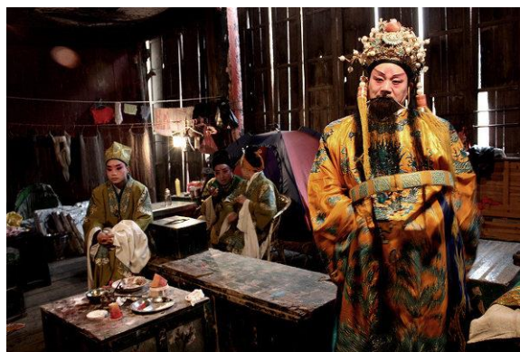
Fig.4. Waiting space on the back stage.

Perpetual stage is a new type of stage based on ancestral hall stage, but absolutely isolated from ancestral hall. It is a single architecture and enhances public space for more villagers to attend an opera performance [5] . It is just like a new open theater for all villagers.