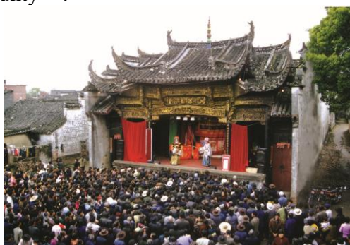
Fig.1. Shine stage of ancestral hall stage in Huyan village.

Leping is a county located in the northeast of Jiangxi Province, China. It lies on 28.98 degrees north latitude and 117.15 degrees east longitude, 60 kilometers east of Poyang Lake. Leping is famous for China village opera stages, which has a reputation as a live "Ancient Chinese Stage Museum". Stage is a center of social culture life, which is integrated cultural space with Chinese opera, architecture, history, folk custom, religion and so on. China village stage has hundreds of years' history as Chinese traditional architecture type. Many existing ancient opera village stages are well protected as tangible cultural heritage in Leping County [1] .