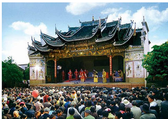
Fig.3. Perpetual stage in Southern Jieshou village.

Perpetual stage is a single architecture type which is different in building scale, spatial relationship and structure. From the stage scale aspect view, they are totally different stages. There are different types perpetual stages: they are three spaces and straight roof supported by four pillars, three spaces and one roof supported by four pillars, three spaces and three rooves supported by four pillars, five spaces and five rooves supported by four pillars and other different intricate stages type. But from the layout plan, fundamental structures, architecture appearance and other aspects view, perpetual stage is the same as other different types of stage. Perpetual stage is usually situated in the central of village, which is an important identification landscape with a big open yard for more people to attend an opera [4] . It is also a public social center for villagers to communicate and get information. The most famous perpetual stage built in Ming and Qing Dynasty is the perpetual stage in Southern Jieshou village (Fig.3).