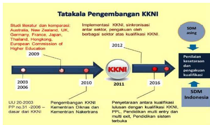
Fig. 1. Indonesian Qualification Framework

By 2016, the Indonesia Qualification Framework, KKNI, see Fig 1, has a duty to give a 1 to 9 valuation for students in workplaces who have multiple points of entry and exit into or out of an open learning system. This qualifications framework needs to be implemented, however, it cannot be presumed that the MEA (ASEAN Economic Community) will start this process soon as the Indonesian Qualifications Framework was developed in 2003 and has experienced a lag time in full implementation. It will mean that graduates of university compete with workers in the workplace who have the possibility of gaining a level 6 certificate within the Indonesian Qualification Framework as an equivalent to a bachelor degree. By 2016, the KKNI will be implemented in parallel to MEA.