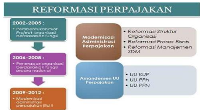
Fig. 2. Tax Reform

tax administration systems. Since the taxation reforms, which started in 2012, the basis of rights and the regulation of national and regional taxation have been modernized. Fig. 2 explains: