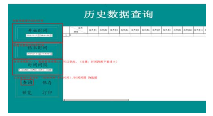
FIGURE IV THE CONTROL INTERFACE OF THE INQUIRY SYSTEM OF THE DATA COLLECTION OF THE MELTER GASIFIER