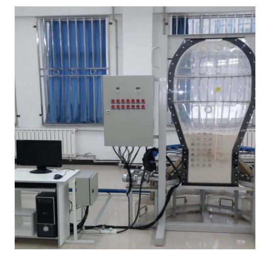
FIGURE I TRAINING DEVICE OF THE MELTER GASIFIER PROCESS

The control mode includes two modes, remote manual control and local manual control. The remote manual control is operated by the operator via the HMI operator interface. The local manual control is operated by the buttons in the control box to control all the motors and valves on the scene.