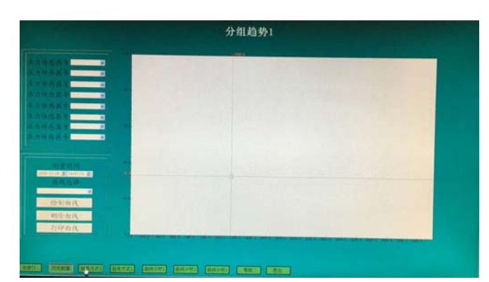
FIGURE V THE CONTROL INTERFACE OF THE GROUPING DRAWING SYSTEM OF THE DATA COLLECTION OF THE MELTER GASIFIER