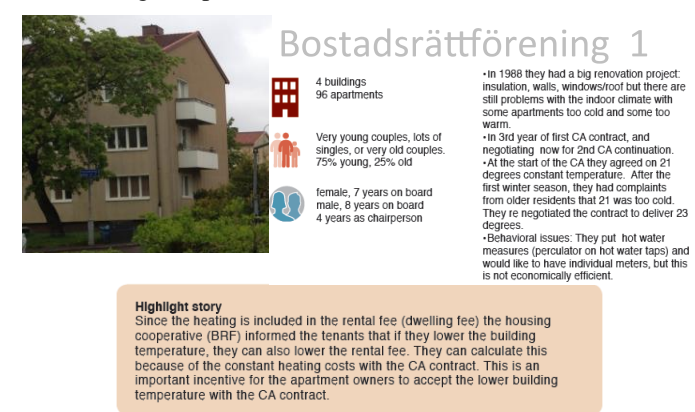
Figure 2. The figure shows the story from a housing cooperative indicating the importance of the CA as negotiation tool to discuss lowering the set indoor temperature.

The interviews show that the reasons for choosing CA are mostly of a technical and financial character. However, as one private property owner mentioned, there is great value in being able to communicate a clear policy on the height of the temperature at the beginning of a new rental contract to establish the right expectations from tenants.