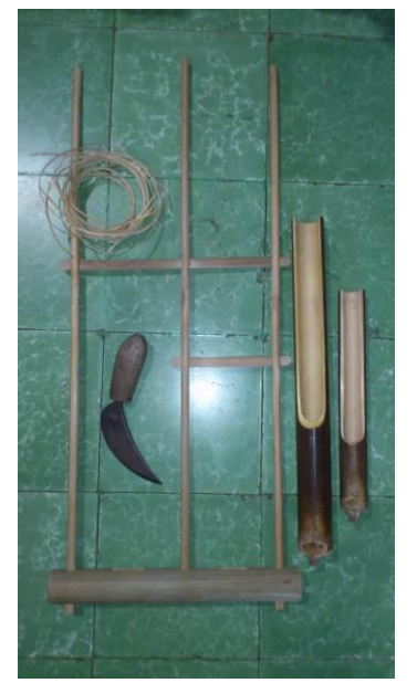
Fig. 5 Angklung Materials Provided for Students