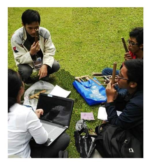
Fig. 6 The Tuning Workshop

The mid semester test consisted of twenty multiplechoice problems and two essays. They had 100 minutes to complete the test. The average of multiple choice grade and essays grade is considered as their mid semester grade.