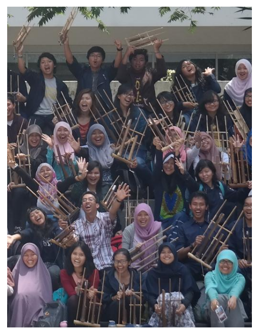
Fig. 1 Students Expressions at the Mini Concert of Angklung Production Challenge.