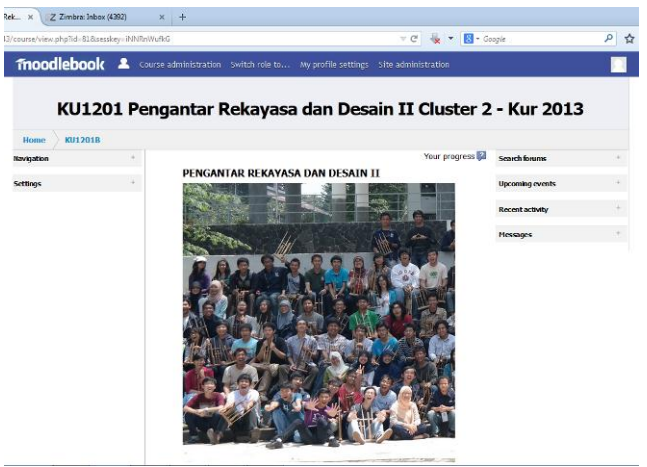
Fig. 4 Snapshot of E-learning Web Site