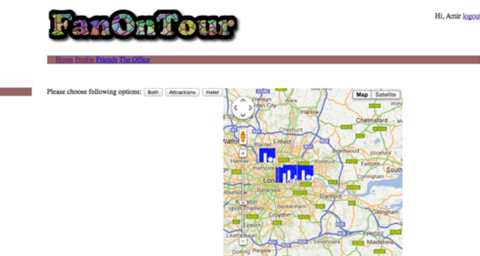
Fig. 4. Customized map shows the location of suggestions

As shown in figure 3 the total amount of traveling is provided at the end of the table, as the user has chosen "High Rated" option in the search box, the application ignores the prices and provides an expensive list of suggestions.