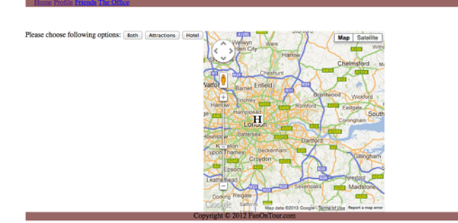
Fig. 5. Customized map shows the location of hotel