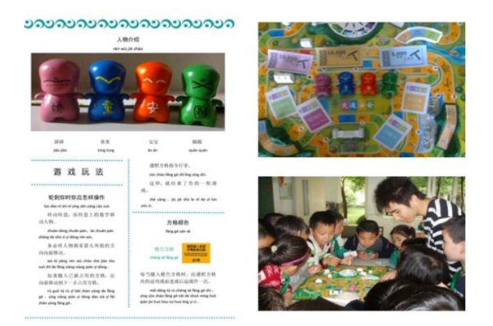
Fig. 2 Traffic safety education chess

Engineering students' innovation ability needs to be inspired and advocated continuously in educational practices, and it also needs to create conditions, scenarios and opportunities to train the students. Then they can gain knowledge in the activities, grow up in the difficulties, enjoy the happy of innovation activities in the achievement, stimulate the continued ability to innovate in the application and practice and generate intrinsic motivation of participating in innovation activities actively. Practices have proved that students who participated in the traffic safety teaching products design competition are very happy to improve their designs continuously in the traffic safety education practice and intend to continue developing related series of products.